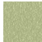
Sage Green Steel